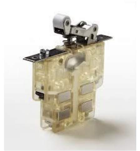
. 4 S820