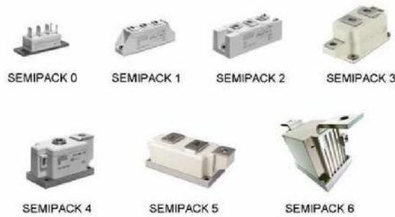
. 1 SEMIPACK